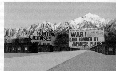
Fig. 2: The sky fills slowly with headlines of war and hate. Tamiko Thiel and Zara Houshmand, Beyond Manzanar , 2000.

The installation offers no way out of the camp by means of overcoming the fence. While the viewer/user sees the passes that lead out of the valley, the fence remains a barrier underscoring the emotional impact of confinement. The person navigating Beyond Manzanar – like the Japanese American internee – has become a prisoner. "Confined within the camp, you have nowhere to go but inwards, into the refuge of memory and fantasy," Thiel and Houshmand explain (Thiel and Houshmand, "History"). Condemned to wander through the camp, one notices racist World War II-era newspaper headlines materialize and disappear again: "It takes 8 tons of freight to k.o. 1 Jap," "We don't want any Japs back here ever!" These anti-Japanese headlines literally "fill the air with hate" (Thiel, "Constructing Meaning") (fig. 2). War screams can be heard, and barracks grow out of the ground plan. The barracks seem inhabited, as photographs illustrating the internees' daily lives at Manzanar can be seen through the barrack windows. Cole Porter's "Don't Fence Me In" can be heard, offering an ironic comment to the situation of obvious confinement. Two love songs by former internee Mary Kagemura Nomura add to the acoustic