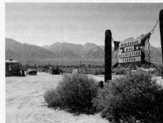
Fig. 1: The security post, Manzanar, 2002.

had blamed the attack on Islamic terrorists, thus provoking a wave of hate crimes against people of Middle Eastern origin. When Houshmand, who was not personally affected by the Oklahoma bombing, happened to visit the site of the Manzanar internment camp on her way to Whitney Portal, it seemed more like a confluence of events (Thiel, "Deja Vu") (fig. 1). She was not only deeply impressed by the