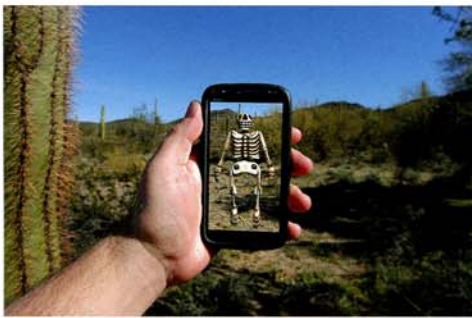
John Craig Freeman. Border Memorial : Frontera de los muertos , 2012. Augmented reality public art, Arizona, USA.

mobile devices. The white cube is thus virtually “invaded,” as artists (and the public) are now able to “write” on the walls of the museum, a twist that reminds us of the changes web 2.0 technologies brought to the previously static World Wide Web. It is tempting to state that AR interventions are redefining the gallery space, but that would take us to the utopian vision of the early net artists, who proclaimed “to be bypassing art institutions” 10 and conceiving of the Internet as a temporary autonomous zone, in which individuals would be on the same level as institutions and the roles of the main actors in the art world would disintegrate and mutate. Net art did not disintegrate the hierarchies of the art world, but rather has been (partly) assimilated by them. AR art may follow the same path, precisely to the extent in which its manifestations tend to support the concept of a white cube where “things become art.” The white cube, in this way, is