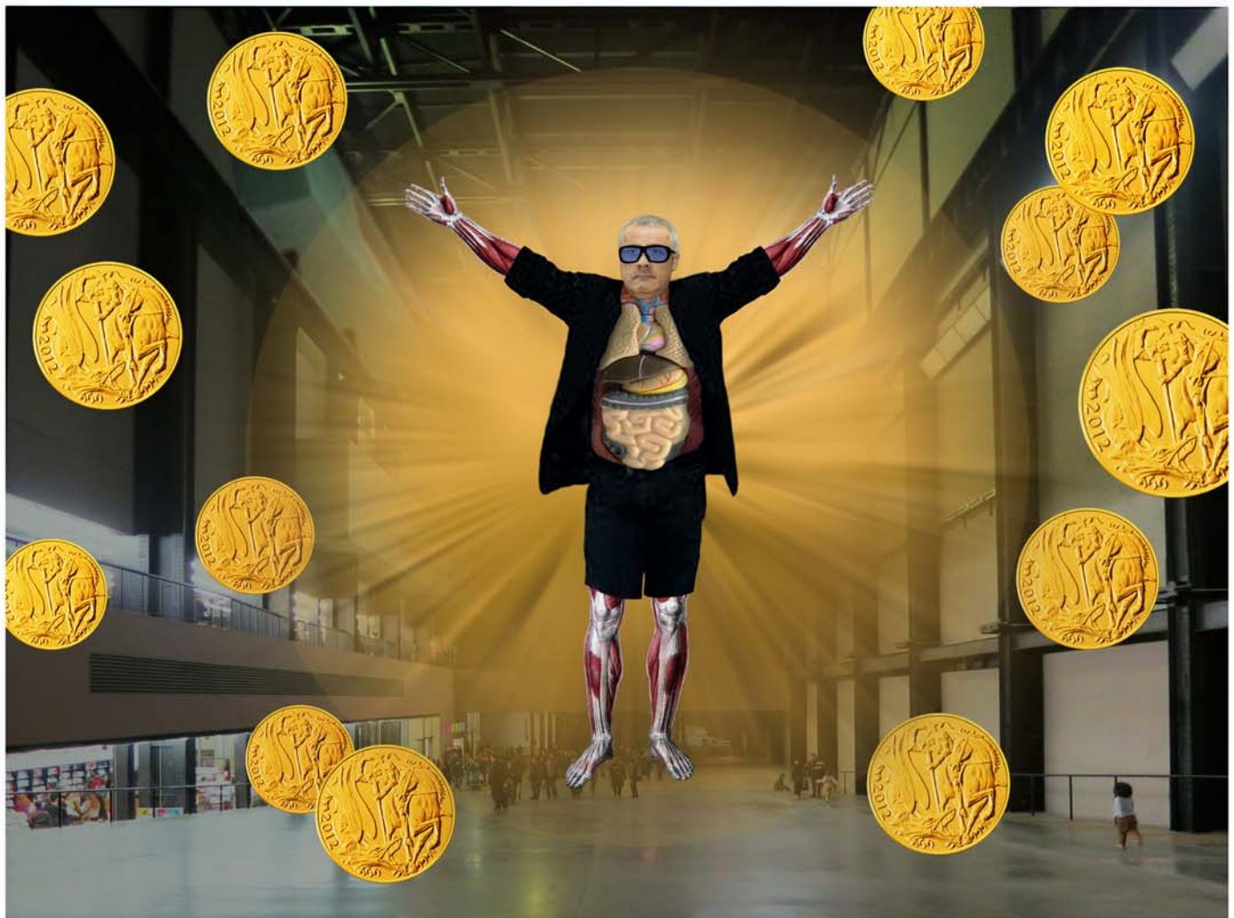
Damien Hirst, All Hail! Tate Modern Turbine Hall.